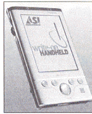
Toshiba Pocket PC e740

Unlike other handheld systems that employ a touch-button approach that can be cumbersome for use at tableside, the simple and intuitive Write-On Handheld allows a server to pay full attention to his or her customers while discreetly writing down their order.