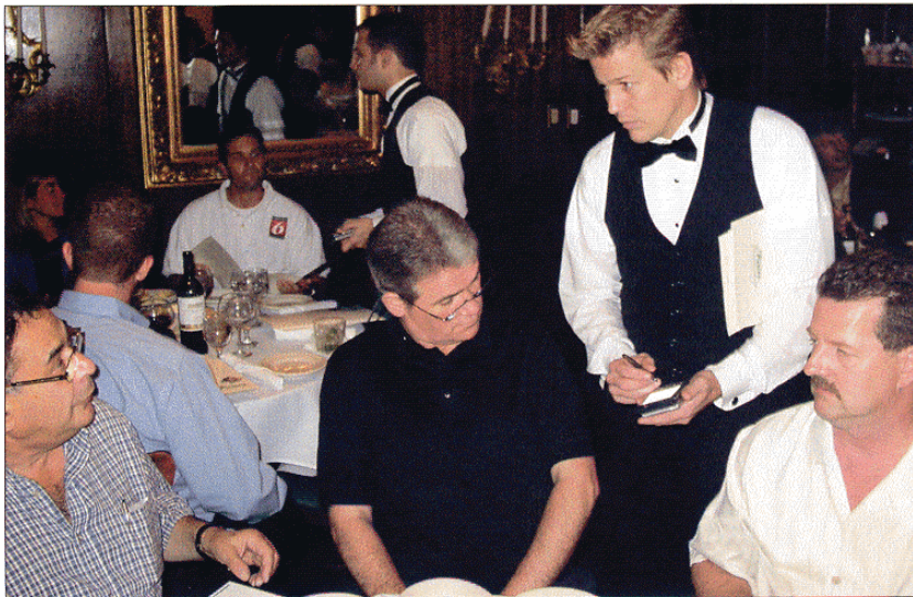
The simple and intuitive Write-On Handheld allows a server to pay full attention to his or her customers while discreetly writing down their order.

POS station and food preparation areas. This 'conventional wisdom' was based on handheld technology being too big, expensive, unreliable and very hard to use. No longer is that the case. The new generation of handhelds are smaller, cheaper and more reliable—and with software this user friendly, it's the first product I have come across that truly has no downside."